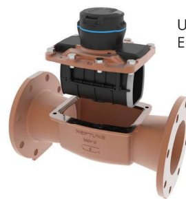
Unitized Measuring Element (UME)