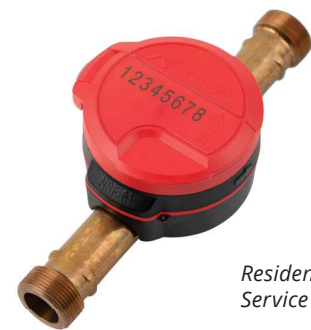
Residential Fire Service Meter